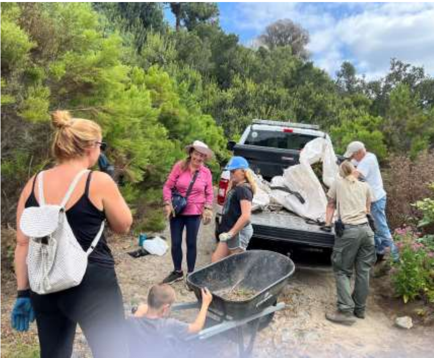
Volunteers at Shawn Canyon Clean-Up September 21