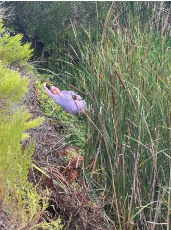
For the Annual Coastal Clean-up Day on September 21 the Friends of Ruffin Canyon sponsored a clean-up at Shawn Canyon (west cul-de-sac). The focus was the removal of non-natives, mainly ice plant, and picking up trash.